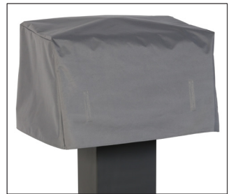
Pull the straps up the rear of the cover and secure each strap firmly.