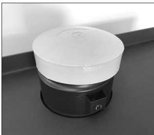
Place the plastic cap over the flue spigot adaptor

Place the all weather cover over your fire with the velcro straps hanging down at the front of the fire. Feed the three velcro straps under the base heat shield of the fire but above the top heat shield of the stainless steel trolley. Pull the straps up the rear of the cover and secure each strap firmly.